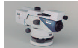
Optical Micrometer OM5 (B20)