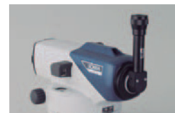
Diagonal Eyepiece DE16 (B20)