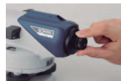
40x Eyepiece EL5 (B20)

- Designs and specifications are subject to change without notice. - Product colors in this brochure may vary slightly from those of the actual products owing to limitations of the printing process.